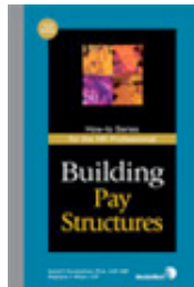
Building Pay Structures How-To Series for the HR Professional