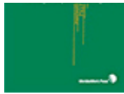
Incentive Pay Creating a Competitive Advantage