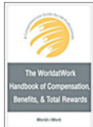
The WorldatWork Handbook of Compensation, Benefits & Total Rewards A Comprehensive Guide for HR Professionals