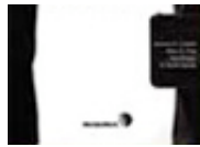
Sales Compensation Essentials A Field Guide for the HR Professional

Executive Compensation Sales Compensation Benefits Health Care Retirement Work-Life Total Rewards All Book Titles