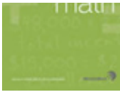
Sales Compensation Math