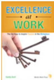
Excellence at Work The Six Keys to Inspire Passion in the Workplace